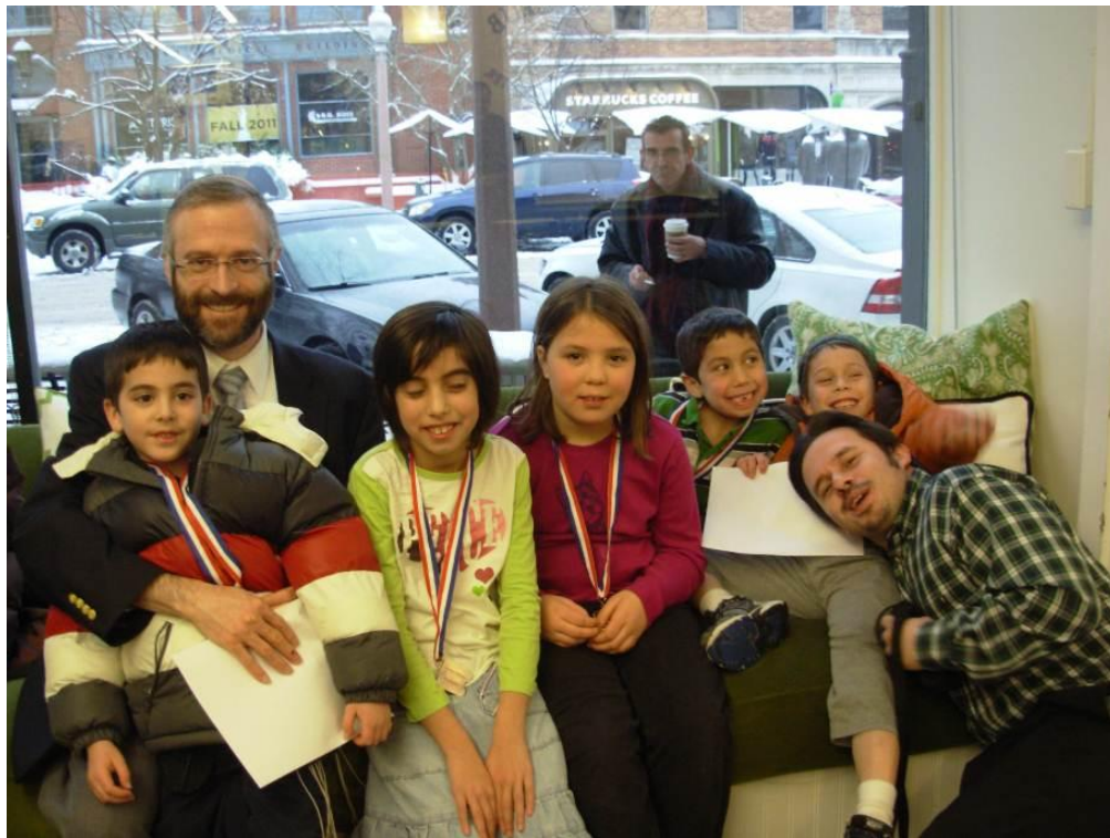
Figure 11: Team Epstein